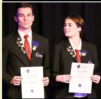
Thomas Donnell and Hazel Stratford UoO Academic Excellence Scholarship