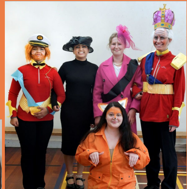
Congratulations to the "Royal Family" and corgi on winning Best Team Costume.

Cancelled in 2021 due to Covid-19, it was a pleasure to once again enjoy the humour and creativity of our Y13s in their last week of school.