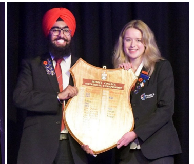
MacDonald House Howick College Inter House Champions